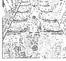
Banquets and Events